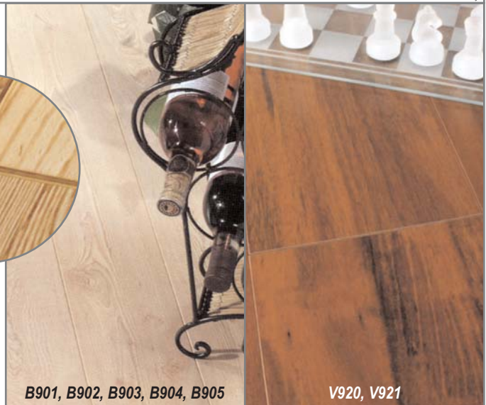
B901, B902, B903, B904, B905